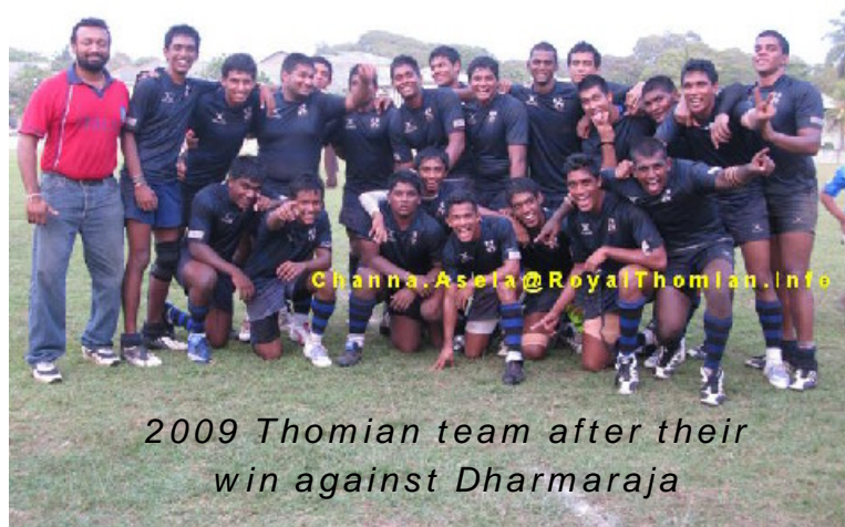
2009 Thomian team after their win against Dharmaraja